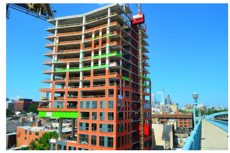
WrapShield SA Self-Adhered (orange) was installed on the new Bridge apartment building in Old City Philadelphia, PA.

As Philadelphia's first LEED Gold building, Bridge provides a sustainable take on luxury. The 146 apartments afford amazing city view, rooftop green space and other high-end amenities. WrapShield SA contributed to LEED points in the Energy & Atmosphere and Indoor Environmental categories.