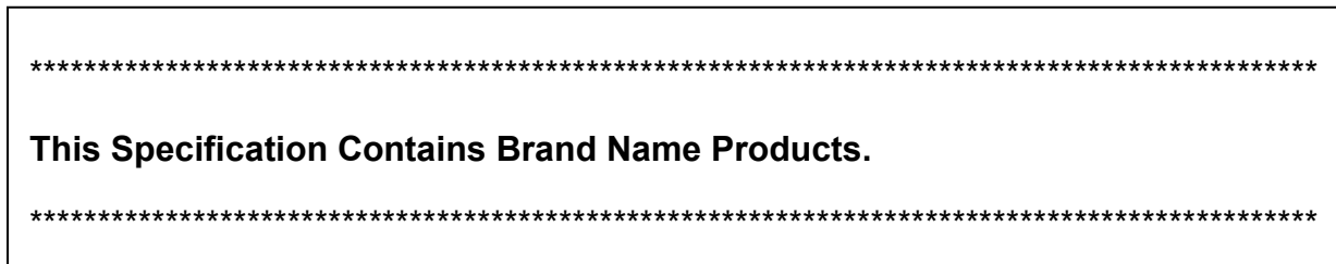
Figure 2-9 Brand Name Notice

Any specification section that contains brand name items must include a notice to that effect on the first page of the section. Place the brand name notice in Figure 2-9 above the section number and title at the top of the first page of the section.