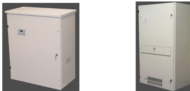
Typical Central Emergency Power Sources with a 10-year Manufacturer's Estimated Service Life Battery