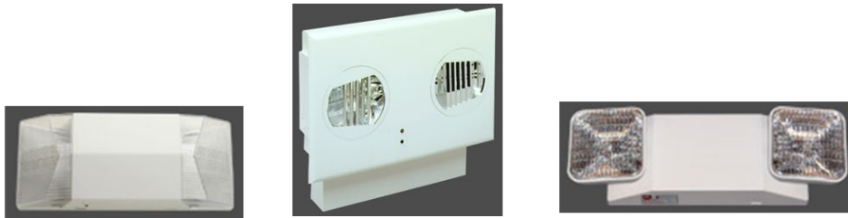
Typical Emergency Light Units with a 5-year Manufacturer's Estimated Service Life Battery