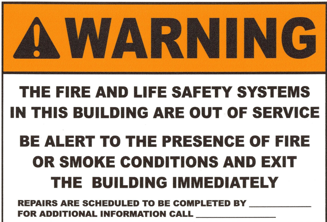
Figure 1-1 System Out-of-Service or Impaired Sign

Note: This sign can be downloaded as an editable PDF from https://www.wbdg.org/dod/ufc/ufc-3-601-02 for local printing. Signs complying with this format can be ordered from many commercial safety sign manufacturers on a wide variety of materials. Commercial computer software and hardware is available to print this and other safety signs on color printers.