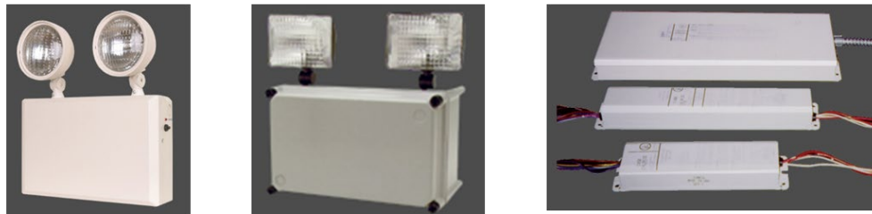
Typical Emergency Light Units and Florescent Fixture Ballasts with a 10-year Manufacturer's Estimated Service Life Battery