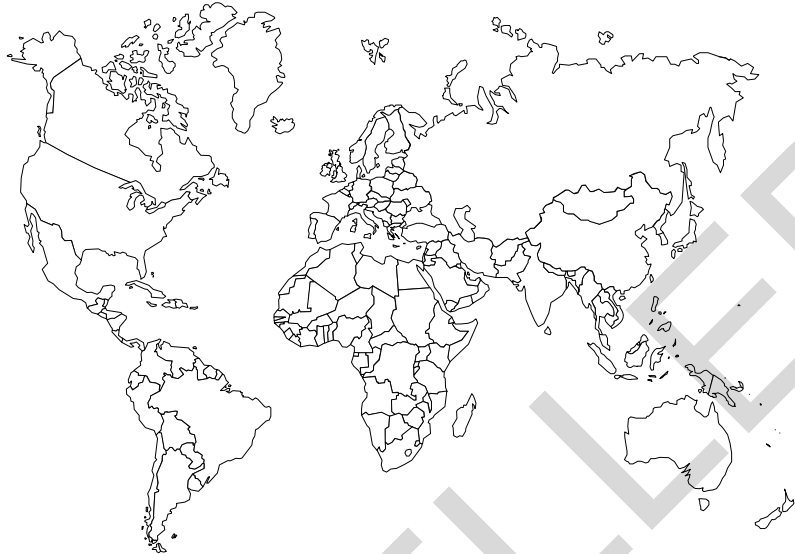
Figure 2-1 Example Figure