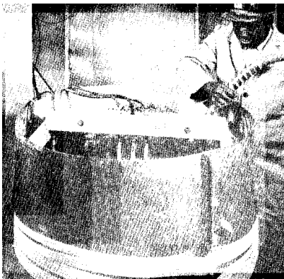
Fig. 2. Preparing mass concrete specimen for temperature-rise test; jacket and positioning of thermometers in specimen are shown

thermometers shall be taped together and tested in a vacuum flask located within the cabinet. During the calibration, air currents shall be excluded from the vacuum flask by use of packing material at the top. When the calibration of all thermometers is within \pm 0.005 F ( \pm 0.003 C) of the average, each thermometer's remaining deviation from the average shall be used as a correction for that thermometer.