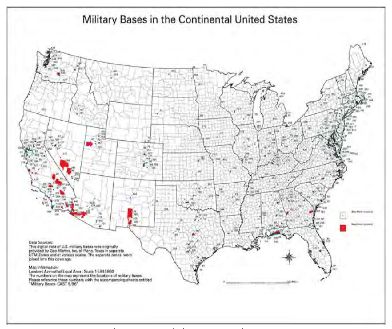
Figure A-2. Military bases in CONUS.