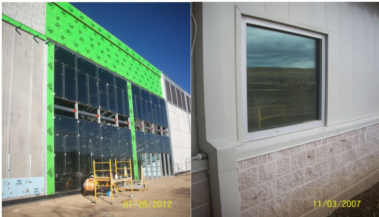
Figure 2: (Left) is an example of a large curtain wall assembly commonly seen in construction applications. (Right) a small fixed aluminum frame window.