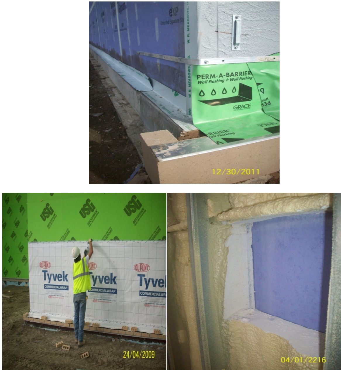
Figure 5: These are examples of the four most common air water and vapor control layer materials. (Top) A fluid applied membrane material and a self adhered membrane functioning as the thru-wall flashing at the mud-sill. (Bottom left) A common mechanically fastened sheet film building wrap product. (Bottom Right) A cut out section of a closed cell spray applied foam applied to the interior cavity of the exterior wall assembly.