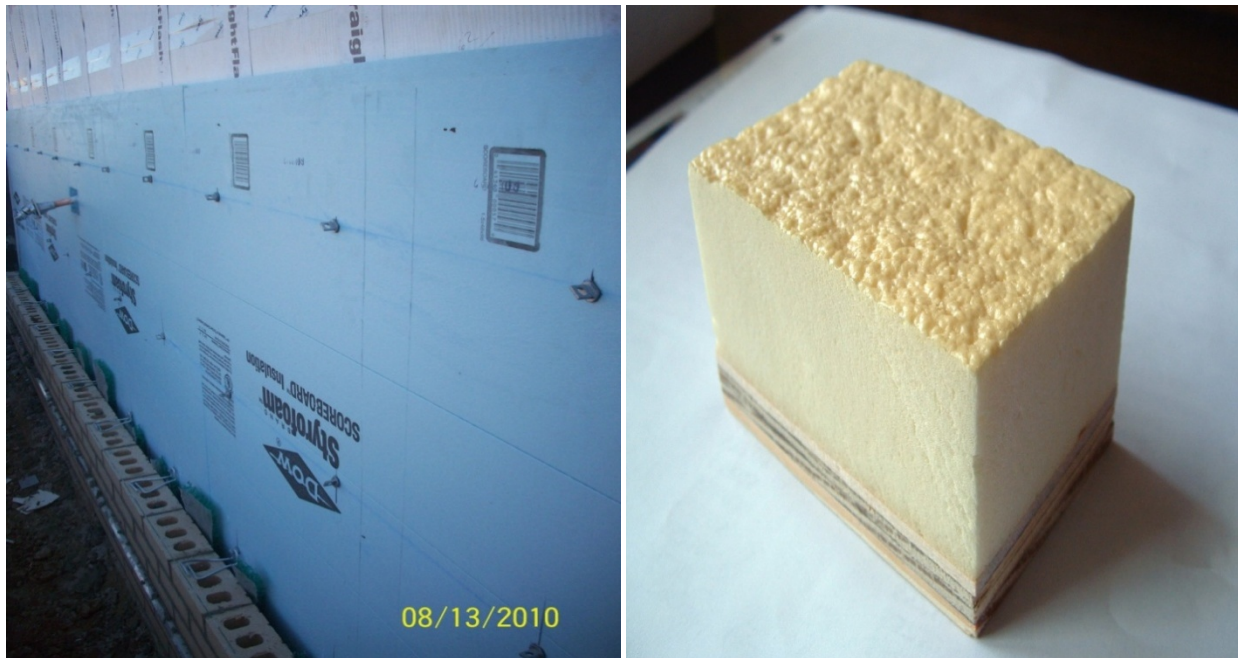
Figure 4: (Left) This installation of the exterior insulation board in this figure is of high quality. Note the boards and joints between them are tight with no large gaps present. Brick ties shown in this installation to are not interfering with the continuity of the insulation and are actually designed to double as fasteners for the insulation boards to the substrate. (Right) An example of a closed cell spray foam insulation material.