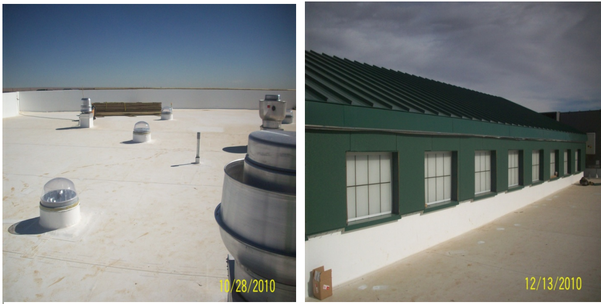
Figure 1. – Left is an example of a fully adhered TPO membrane roof system. On the right, a standing seam metal roofing system.