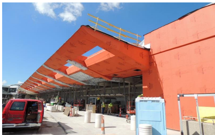
WrapShield SA easily adheres to multiple substrates effortlessly accommodating complex installation conditions.