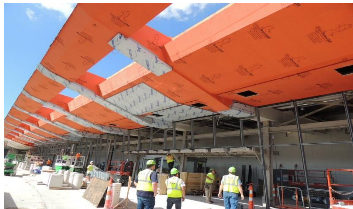
Free of harmful VOC's and entirely self-adhering, VaproShield's WrapShield SA Self-Adhered was easily installed on the detailed, overhead soffit structures. Conventional products would have dripped down onto installation crews.

Free of harmful VOC's and entirely self-adhering, contractors installed over 60,000 sq. ft of WrapShield SA Self-Adhered on site at the airport without jeopardizing passenger safety or disrupting the day-to-day flow of travellers. Cleveland Hopkins International Airport's newly modernized and upgraded upper ticketing level and lower baggage levels are due for completion in 2016.