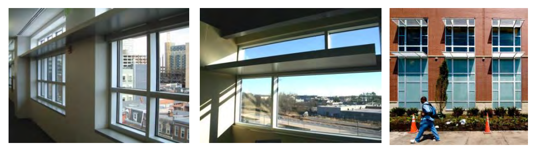
(Sources: http://www.alcoa.com/global/en/products/product.asp?prod_id=1852; http://www.greenedu.com/blog/2009/10/19/light-shelves-and-leed.html)